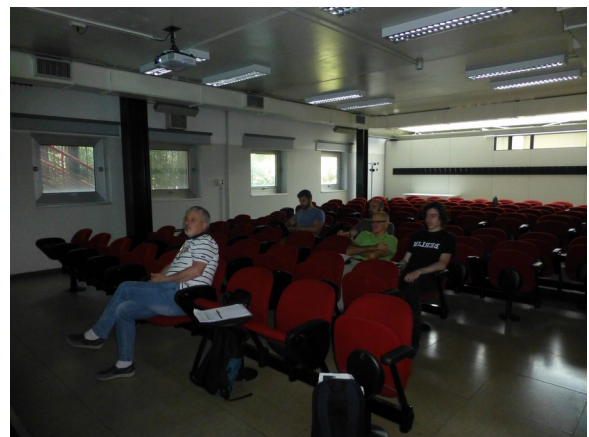
Some of the participants during the question time