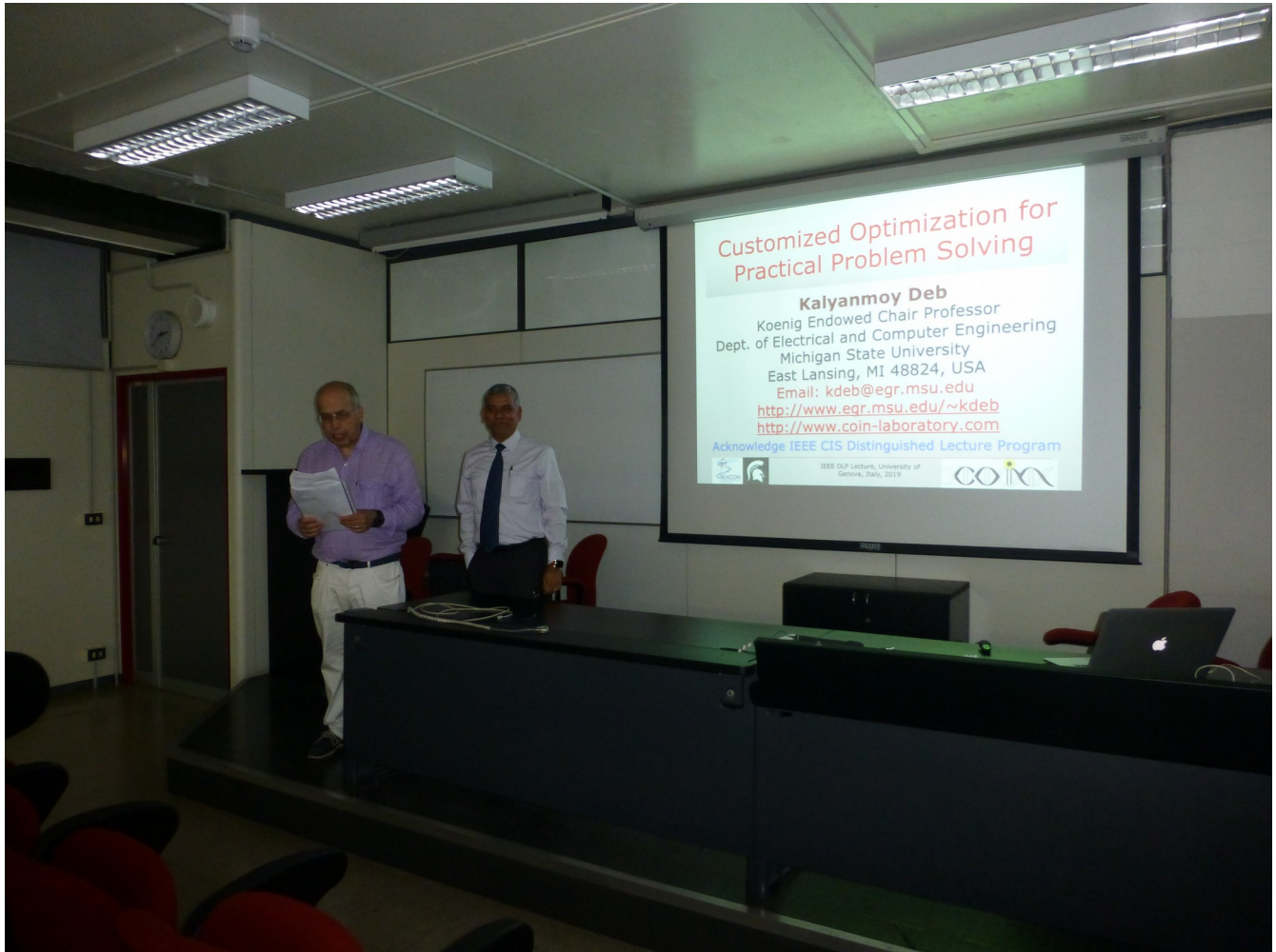
Introduction to the lecture